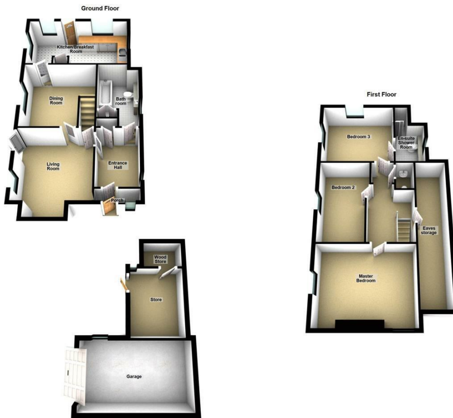
Burygate Cottage, Bearswood, Storridge